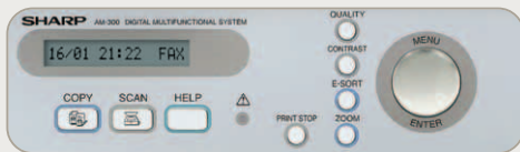
User-friendly control panel