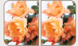
600 x 600 dpi 300 x 300 dpi

When you use the AM-300 to scan original documents onto your PC, a wide spectrum of colours is faithfully retained, with up to 600 x 600 dpi resolution. You can then use those scanned files to create vivid, high-impact colour documents or presentation materials.